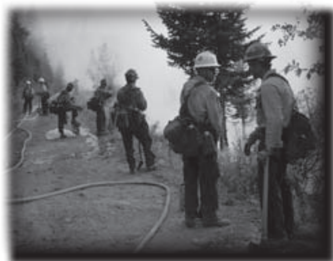
Figure 1—With the spread of West Nile virus, mosquitoes are more than a nuisance for wildland firefighters.